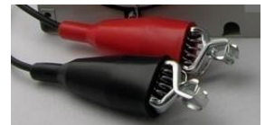
Alligator or Magnet Clamps

Carrying Case not available Option: Alligator clamps available