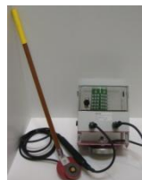
Under running Third Rail and other styles available.

Carrying Case not available Option: Alligator clamps available