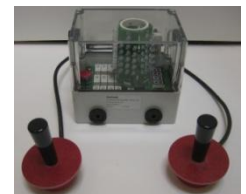
Other Models Available