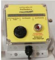
4" x 4" x 2.5" / 10.16cm x 10.16cm x 6.35cm Weight 2lbs (.907kg)