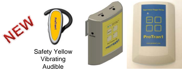
Safety Yellow Vibrating Audible Blue Tooth

Blue Tooth, Personal Armband Device (PAD) and (FD) Worn on the workers Arm or hand held