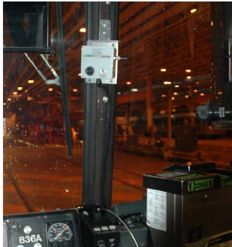
TD mounted in an operators cab.