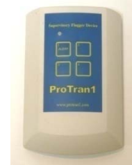
Flagger Device (FD) Wireless Flagger Alarm