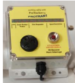
Train Device (TD) Placed in operators cab