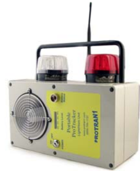
Portable Warning Horn/Light (PWLH) Placed in work zone