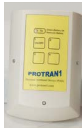
Personal Alert Device (PAD) Worn by track personnel