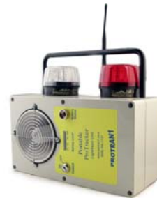
14" x 6" x 8" / 35.56cm x 15.24cm x 20.32cm Weight 7lbs (3.17kg)