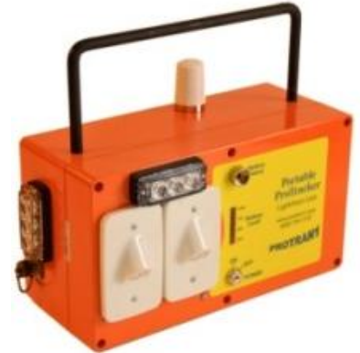
Portable Warning Horn/Light Placed near work crew