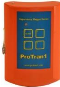
Flagger Device Wireless flagger alarm