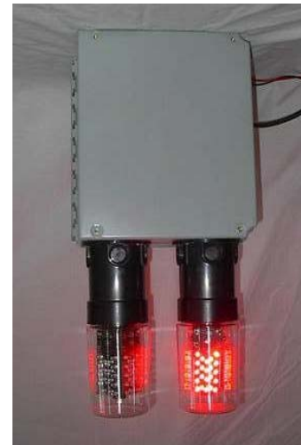
RED LED for 50 - 1000 VDC